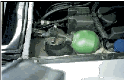
Figure 2: Citroen Xantia upper mounting viewed from under bonnet.

If presented with a Citroen Xantia or XM vehicle, the vehicle inspector must fail the vehicle if any sign of deterioration or failure of this component is detected during the inspection.