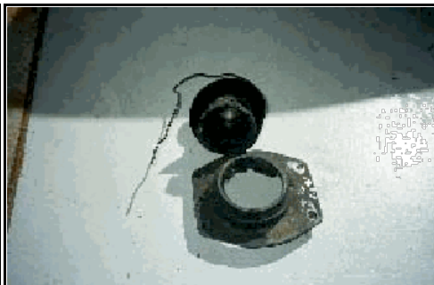
Figure 3: Citroen Xantia rubber mounting in separated (failed) condition.