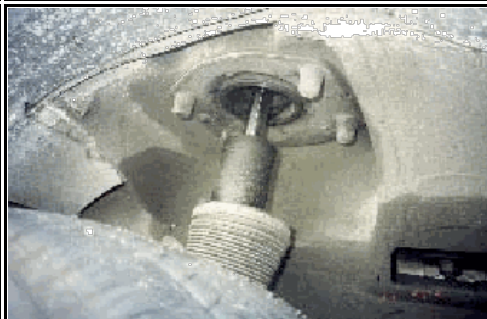
Figure 5: Citroen Xantia upper suspension mounting viewed from underside with protection gaiter removed to allow for better inspection.