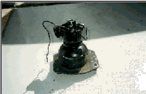
Figure 4: Citroen Xantia rubber mounting assembly in separated (failed) condition.